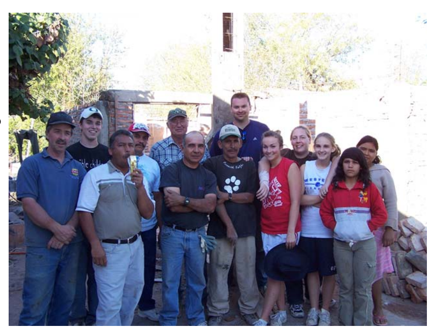
Nehemiah's wall builders have nothing on this smiling group of laborers (both US and Mexican) who spent 15 days building a parsonage and encouraging lives in northwestern Mexico.

"So often the younger generation doesn't get a chance to go to the mission field,"