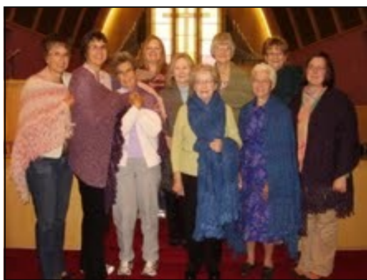
Prayer Shawls were given at Sister-Care in WA. Each group decided who at their table would receive the gift prepared by women of Mountain View Mennonite, Kalispell.

PNMC Sister-Care across four states, on three October weekends, in three locations brought together 122 women to learn and grow in understanding ourselves, our call to care for others, listening to one another, and the willingness to share some of our own story. Each seminar had several women telling a personal story of loss and grief. We appreciated the support of pastors who joined other women from their congregations in the seminars.