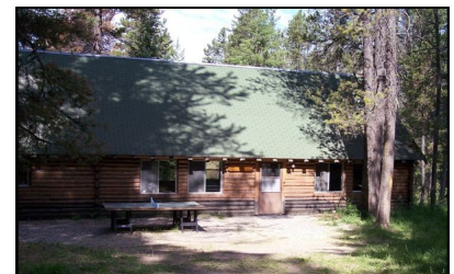
Lodge at Palisades Camp