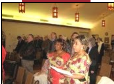
Closing worship service