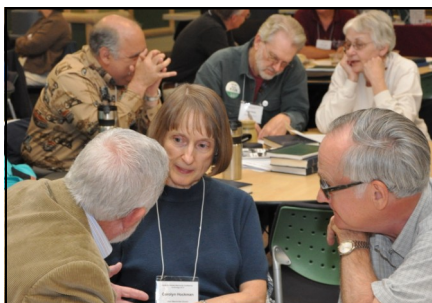
Participants dwell in the Word together