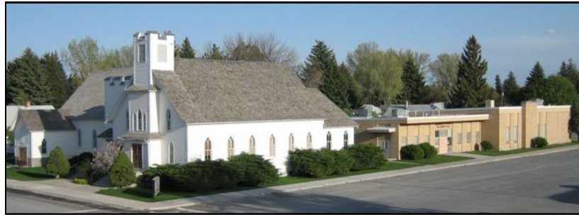
First Mennonite church building and fellowship hall

Since its birth in 1907, the church has had many significant ministries. Since 1958, one of our ongoing ministries has been camp ministry. The church operates a summer Bible camp program for Junior and Senior Youth, grades 4-12, as well as family camp on Labor Day