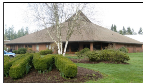
Western Mennonite Church

the easiest thing for Mennonites to fully understand and put into practice.