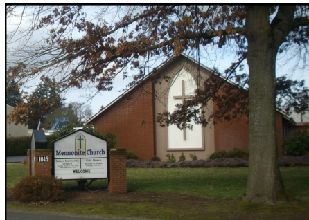
Salem Mennonite Church where Vida Nueva also meets for worship