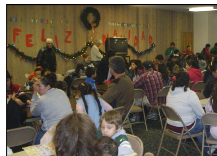
Christmas party at SEKCC (Southeast Keizer Community Center)