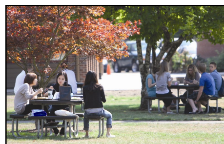
WMS students enjoy a break on campus

Visit Western's website to learn more about the school at westernmennoniteschool.org