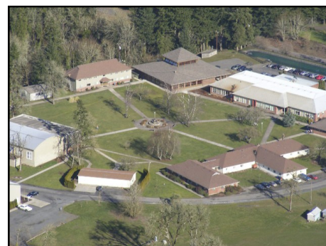
Aerial view of part of Western's 45-acre campus

Western is located in the Willamette Valley just outside Oregon's capital city of Salem. It is in a rural setting between Salem and McMinnville. Located only an hour from the Pacific Ocean, the Cascade Mountain Range and Portland, students are able to experience the variety of historic, cultural and scenic opportunities offered only in the Pacific Northwest.