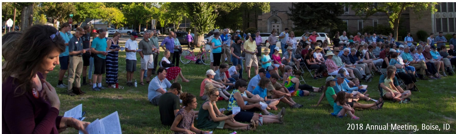
2018 Annual Meeting, Boise, ID

Follow link to article in Idaho Press here .