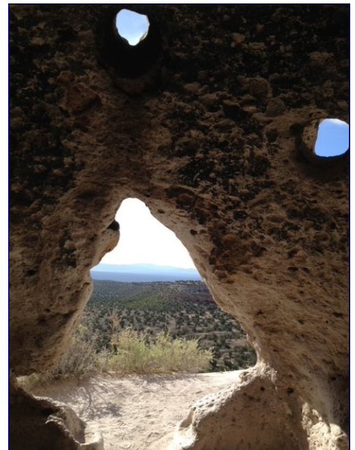
Cave Dwelling, Bandelier National Monument, NM.

This reflection is adapted from an Advent sermon offered at Salem Mennonite Church on Sunday, December 10, 2023.