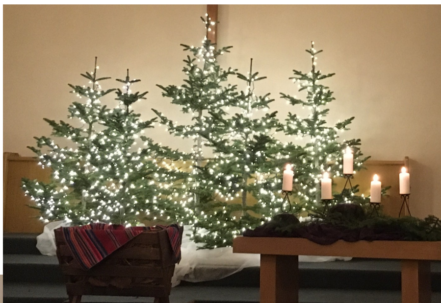
Photo Left: Advent lights hanging in Seattle Mennonite's sanctuary