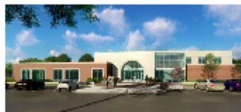
Architect rendering of a new wellness center