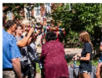
Students and faculty tie prayer ribbons to a cross