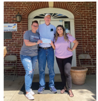
The 2023 and 2024 nursing club presidents present a $1,000 check to New Hope Shelter.