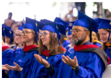
Seminary graduates receive a blessing at EMU commencement

On May 7, EMS celebrated its largest graduating class since before the pandemic in 2019. Nineteen graduates earned master’s degrees in Christian leadership, divinity, and religion; and certificates in Christian studies, general theology, and faith-based peacebuilding. 2022-23 seminary enrollment was strong, with a 14% increase over the previous year.